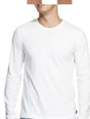
Plain white or navy T-shirt only to be worn under uniform