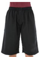
Woven navy shorts