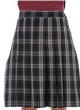
College Kilt Style Skirt.