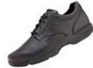
Predominantly Black covered-in shoes