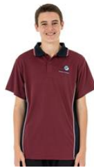
Maroon college polo shirt