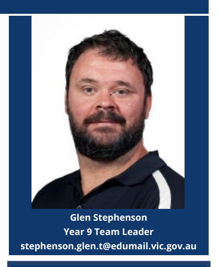
THE YEAR 9 TEAM

Throughout the remote learning period, teachers will be keeping a record of student engagement and participation. To acknowledge all the hard work that will inevitably be completed over the next 6 weeks, students are reminded that $10 E-gift cards will be up for grabs for those that consistently engage with and show exceptional resilience with regard to remote learning.