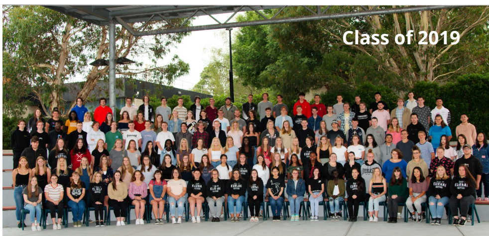
Class of 2019