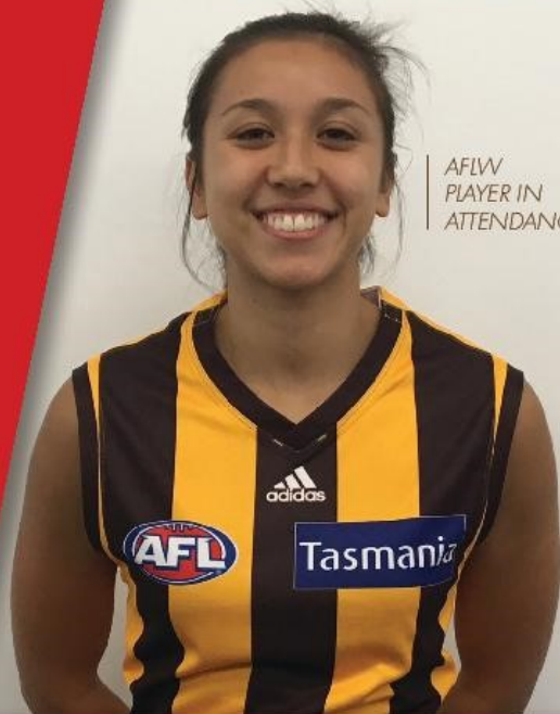
AFLW PLAYER IN ATTENDANCE

PARENTS/ GUARDIANS ARE WELCOME TO ATTEND