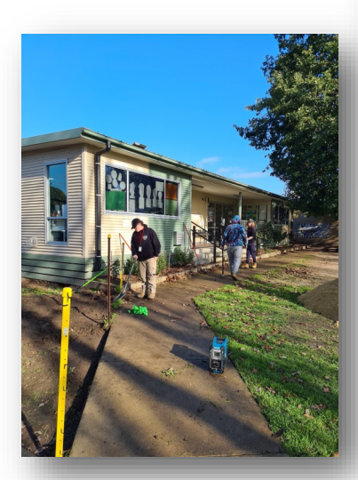
Year 10 Structured Work Placement