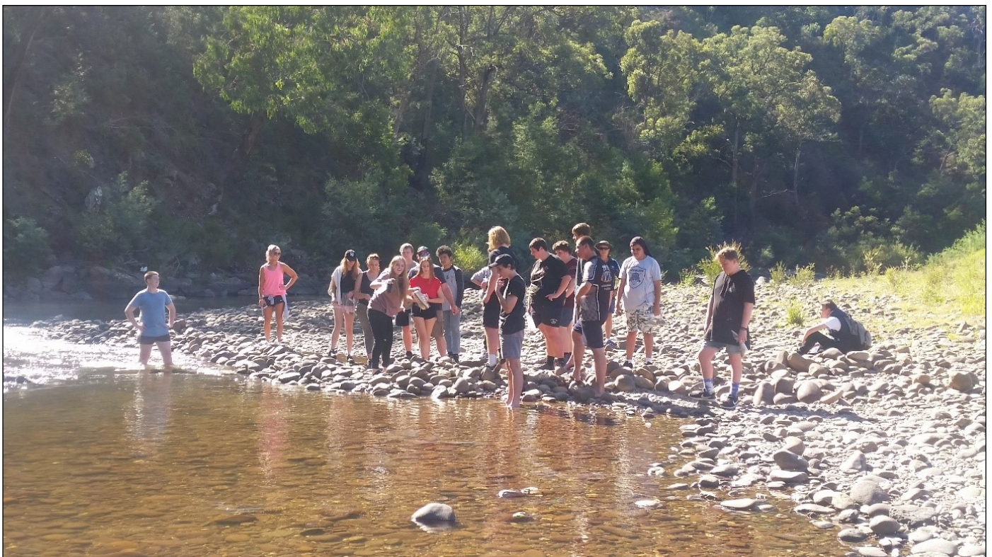
The students enjoying their time at Paradise Valley